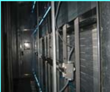
Units to installed in front of large coil banks